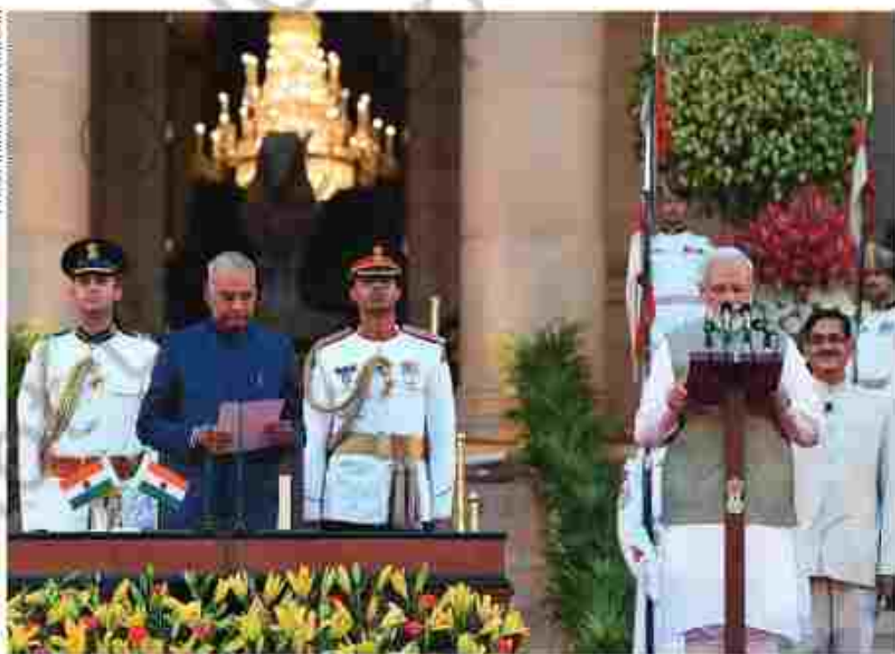
The President, Shri Ram Nath Kovind administering the oath of office of the Prime Minister to Shri Narendra Modi, at a Swearing-in Ceremony at Rashtrapati Bhavan on 30 May 2019.